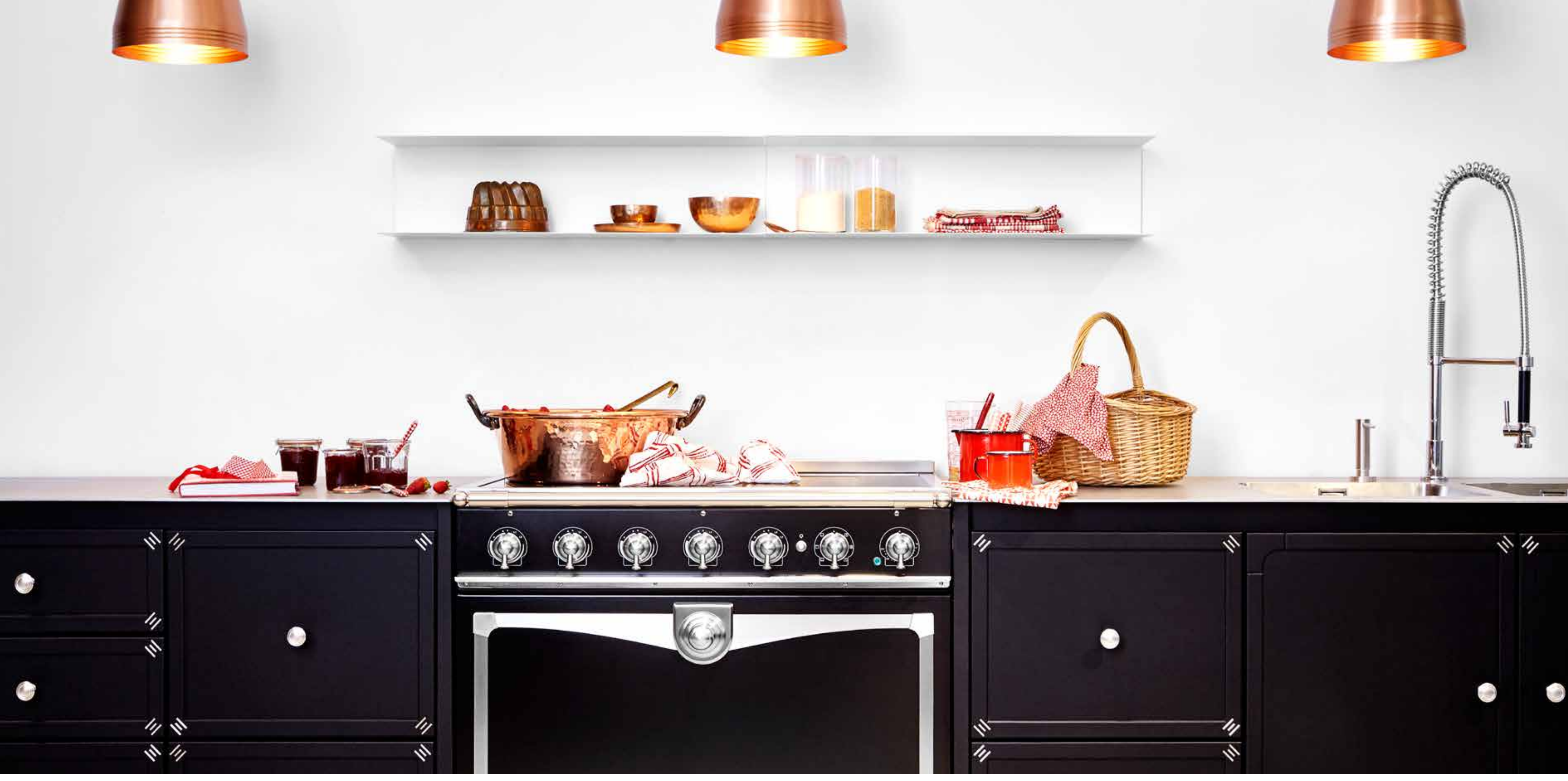
CORNUFÉ ALBERTINE AND MÉMOIRE FURNITURE