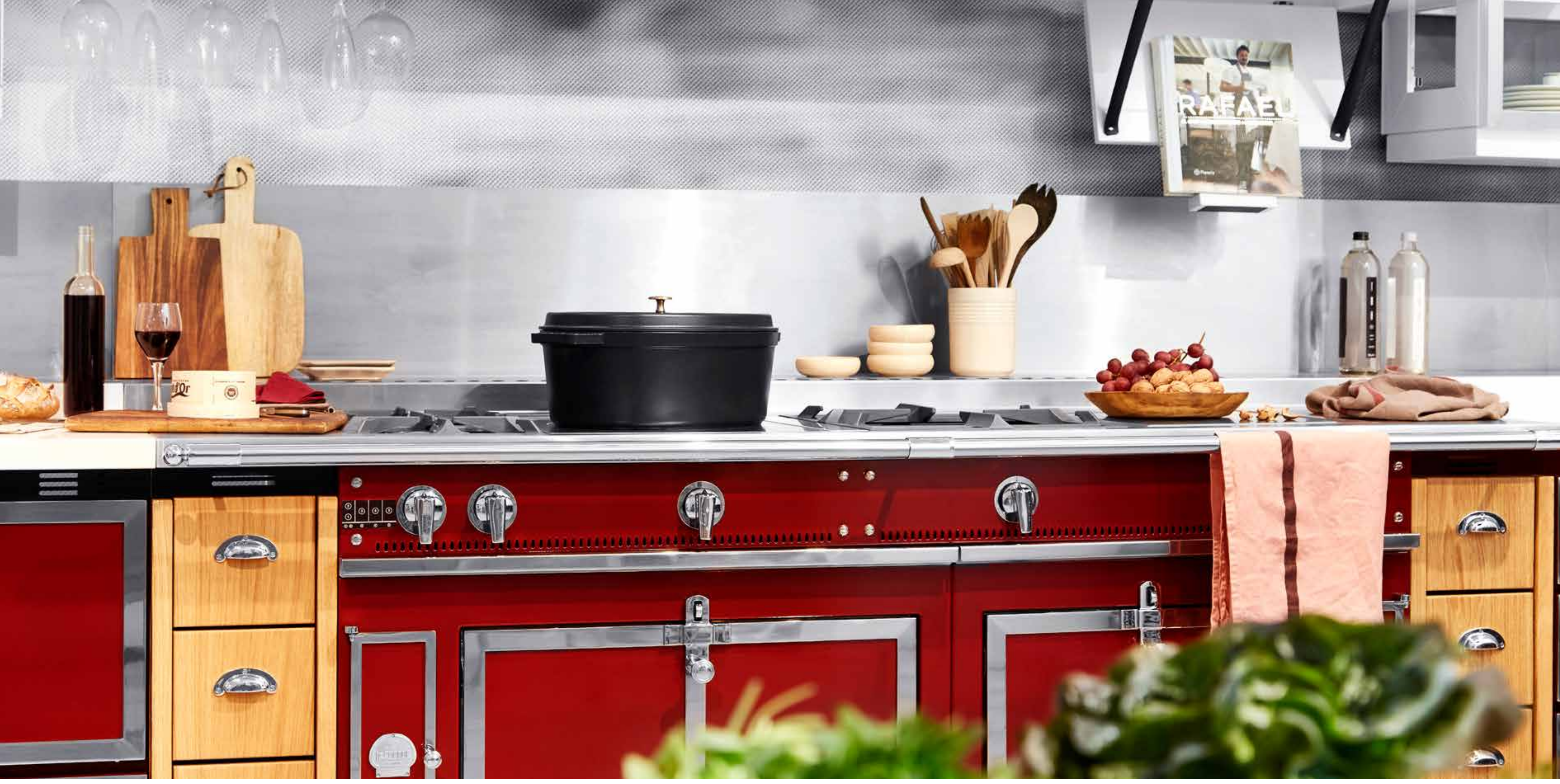
GRAND PALAIS 180