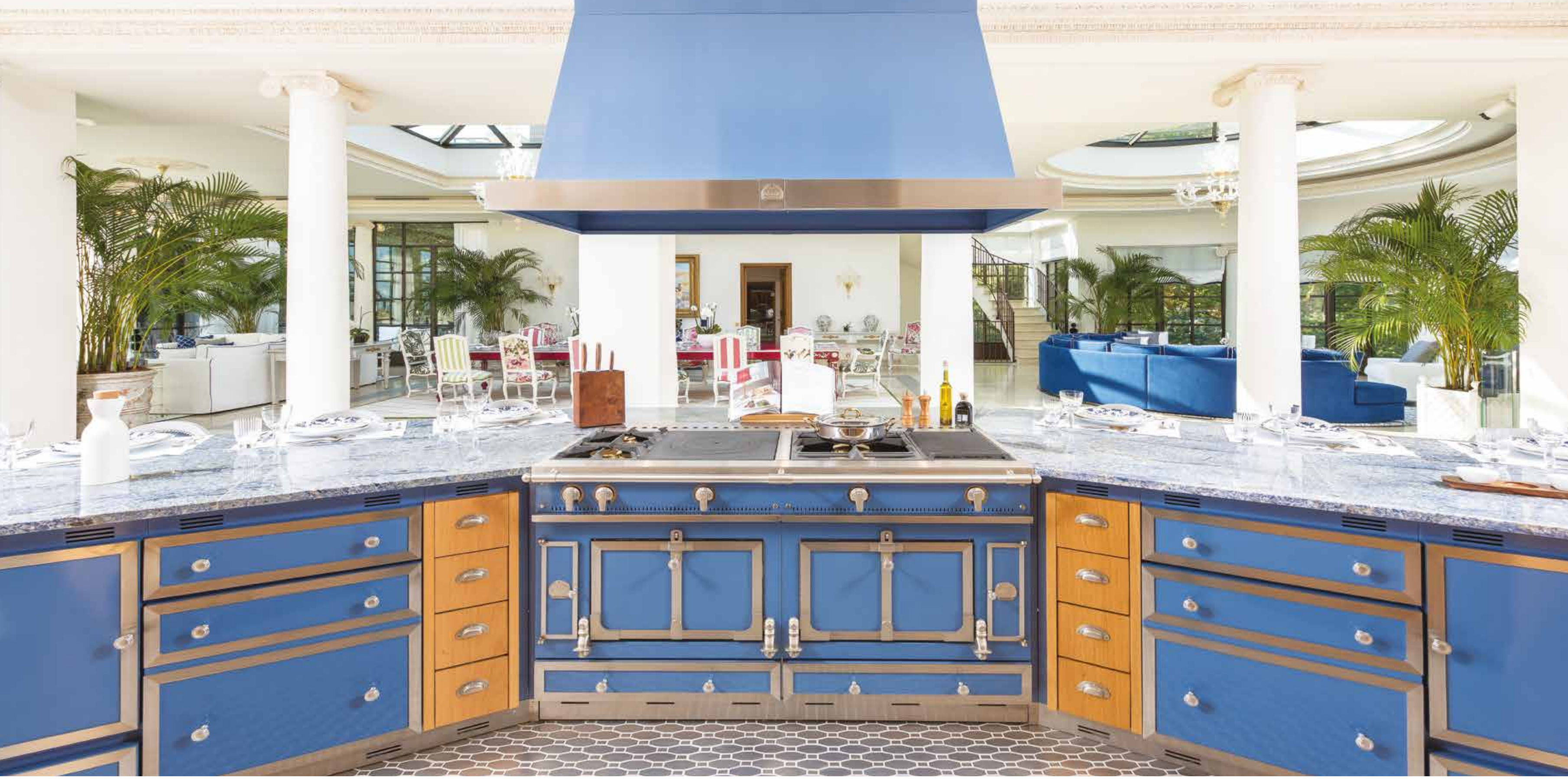
A COGEMAD, HAUTE-COUTURE ESTATES & INTERIORS, PROJECT